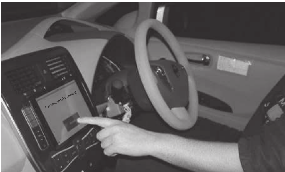
Figure 4: Control panel of a self-driving car